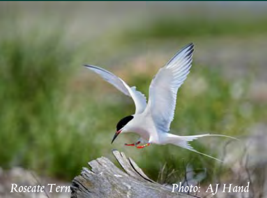
Roseate Tern