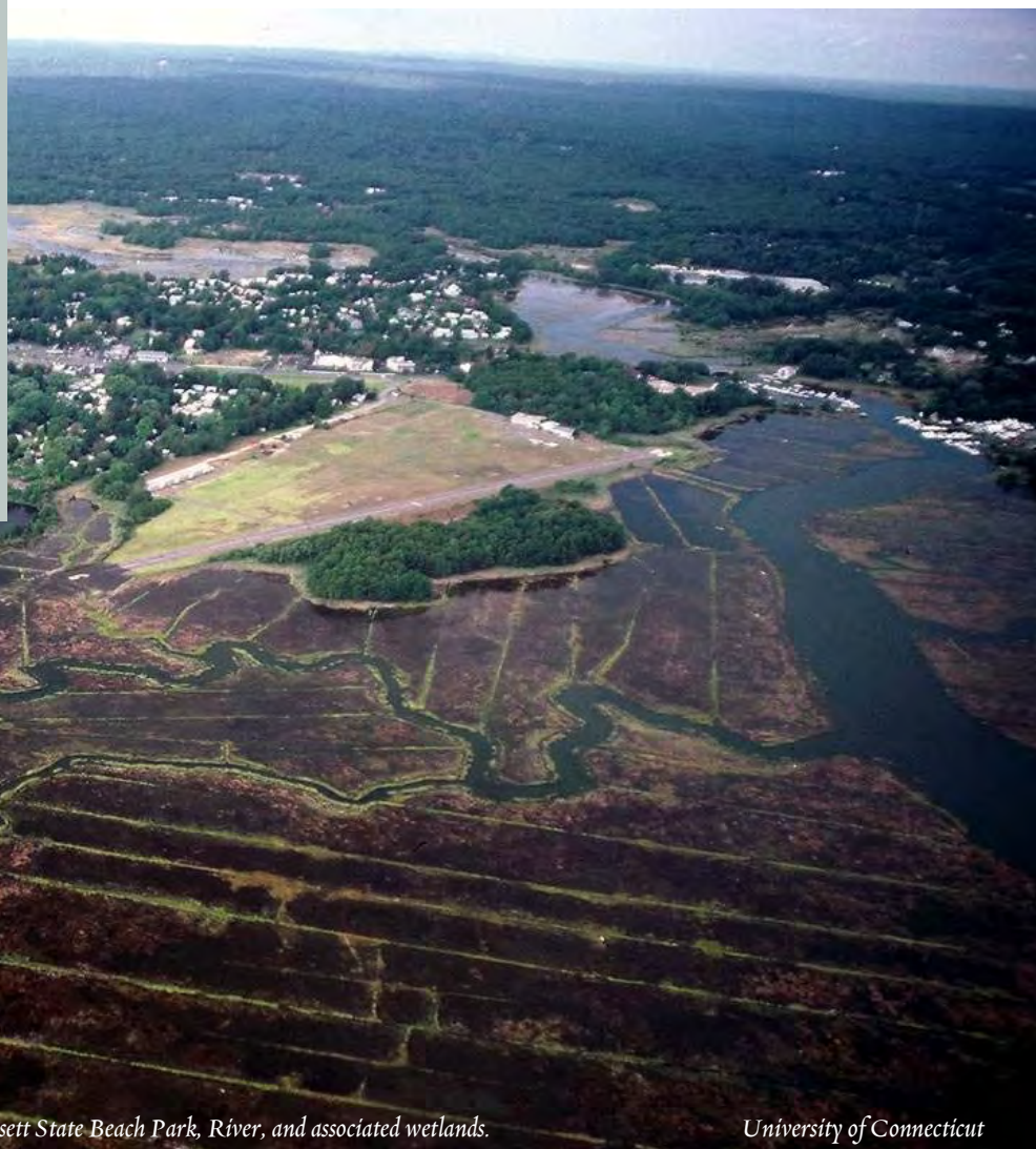
Griswold Airport at center, encompassed on three sides by Hammonasset State Beach Park, River, and associated wetlands.

If we are unable to raise the funds for the purchase of the land, it will be developed with 127 units of active adult housing, virtually creating a new village in Madison. This will include a very large public septic system. The construction and development on this land will cause irreparable damage to the natural resources and will severely impact the Hammonasset River and waters of Long Island Sound. The natural buffers that exist now will no longer function adequately, and will create new impervious surfaces on the site. The entire ecological system will be damaged.